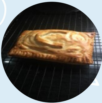
HOMEMADE SAUSAGE CHEESE AND BEAN PASTY

is an amazing life skill to have because there is going to be a time when you are going to live by yourself so that means you will need to make your own meals. We have suggested some recipes that you could try for yourself!!