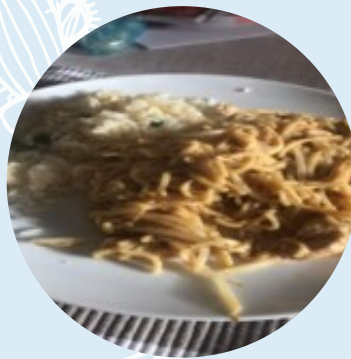
HOMEMADE CHICKEN CHOW MEIN