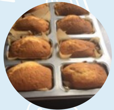
HOMEMADE MINI BANANA LOAF